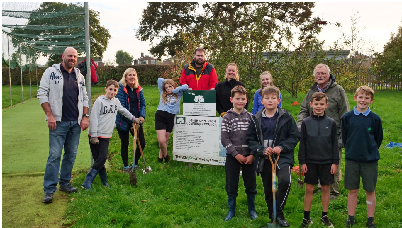
Some of the village community who helped out with the Spring bulb planting last month

Many thanks to everybody who came down and helped out, it was much appreciated by everyone on the Council.