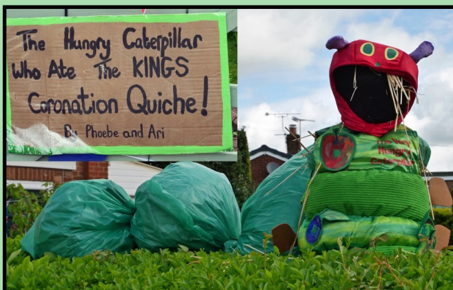
Third prize: The Hungry Caterpillar who ate the Coronation Quiche