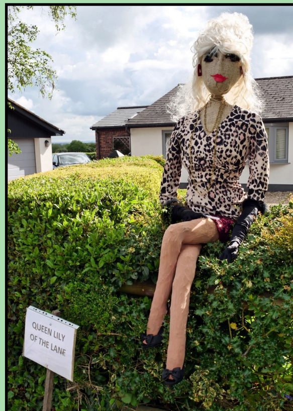
First prize winner: Queen Lily of the Lane

It must be said that the Community Council are extremely grateful to all who took part and no-one went away empty handed as every scarecrow earned a small prize for taking part. Time to start planning your entry for the next competition!