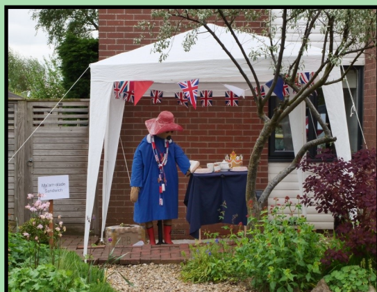
Second prize: Ma'am-alade Sandwich