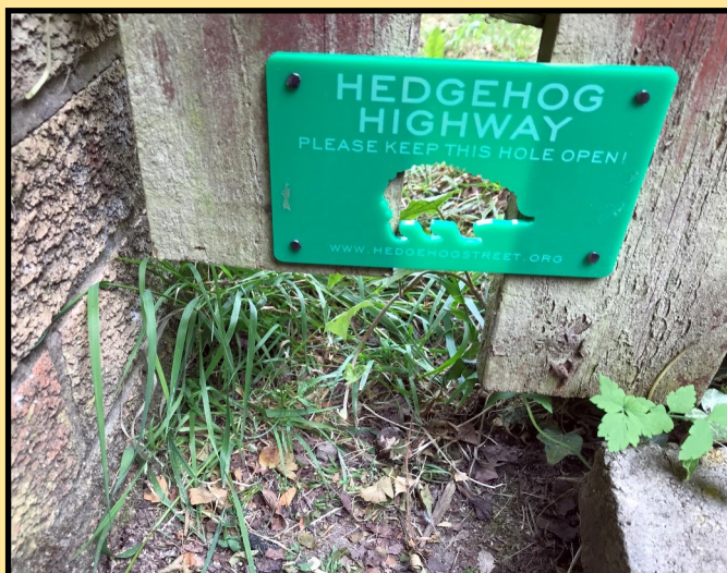
Hedgehog Highway.

The good news for the village, though, is that you can help. In 2011, Hedgehog Street ( https://www.hedgehogstreet.org/ ) was set up by the British Hedgehog Preservation Society and the People's Trust for Endangered Species to raise awareness and build community action to support hedgehog populations. The site gives many tips as to what you should and shouldn't be doing in your area. One of the main actions you are encouraged to take is to make a hole in your garden fences, or under them, so that hedgehogs can move freely from one area to the next – they frequently travel around a mile in a night. As stated on the Hedgehog Street site: "No one garden is enough. Hedgehogs need neighbourhoods of linked up gardens to survive". A