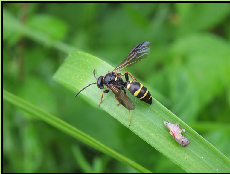
Digger wasp that preys on frog-hopper nymphs

Needless to say, that's not the case - wasps too pollinate plants. They also rid our gardens of what many consider pests, such as aphids, weevils and caterpillars, as these