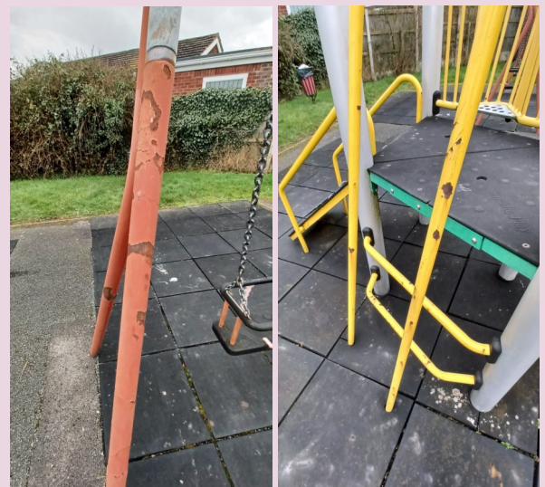
Damaged metalwork on the play equipment

Following this site meeting, FCC made arrangements to replace the swings and to refurbish the remaining items of play equipment as required with the cost being met by FCC via Section 106 funding for play space improvements and additionally agreed to install a pedestrian gate from the alleyway entrance off Blanter Road to improve safety for little ones.