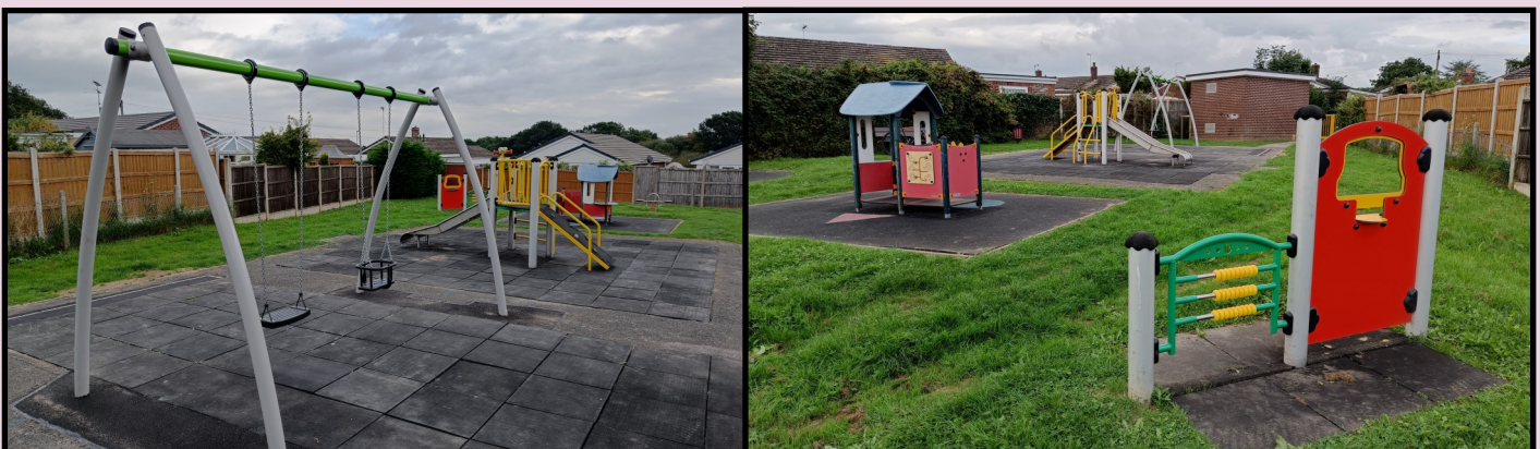
The newly restored play equipment in St Davids Park

The works were completed in August and the before and after photos hopefully demonstrate the improvements to the play area which has a range of play equipment to appeal to younger children. The location map pinpoints the play area (in red) and we would welcome your comments and feedback regarding the recent improvements.