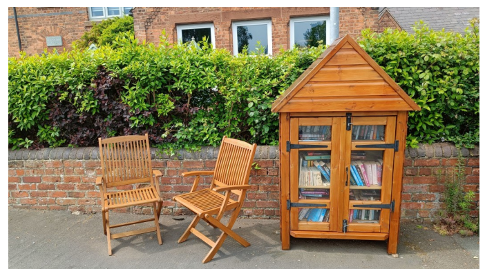
Library and chairs as good as new thanks to Gill and Richard Cannon

Finally, the volunteer group were out and about again tidying up the borders by the village notice board. It's all looking much tidier now!